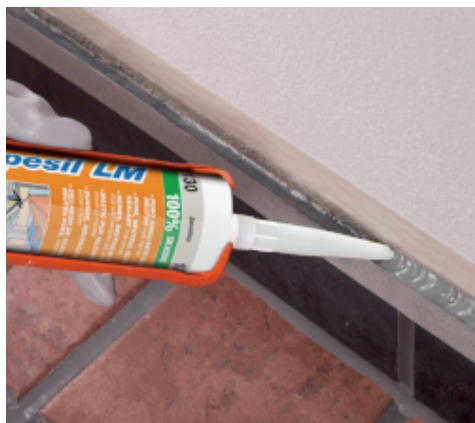
Sealing a fillet joint on natural stone